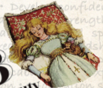
Story 3 Sleeping Beauty