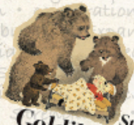
Story 1 Goldilock & The Three Bears

Music Language Literacy Numeracy Understanding the world Expressive arts & design