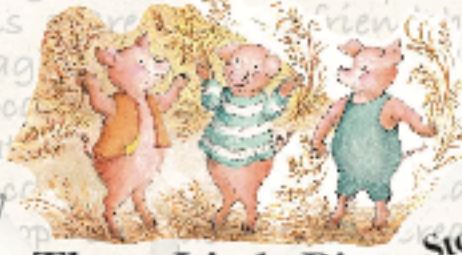
Story 2 Three Little Pigs